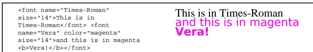
Figure 3-7: Using TTF fonts in paragraphs