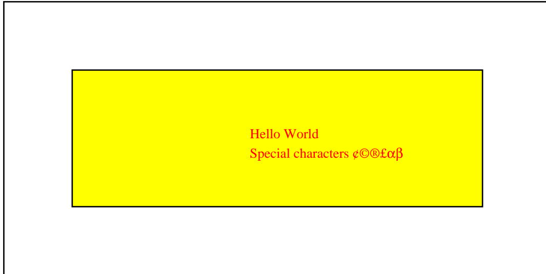
Figure 11-1: 'Hello World'

This will produce a PDF file containing the following graphic: