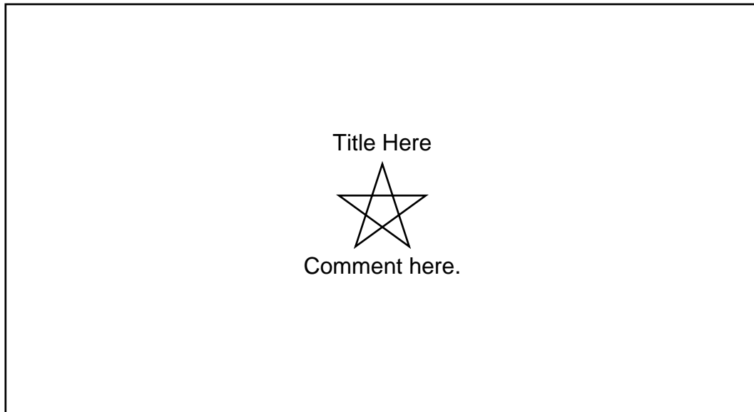
Figure 2-21: line style parameters

The star function has been designed to be useful in illustrating various line style parameters supported by pdfgen.