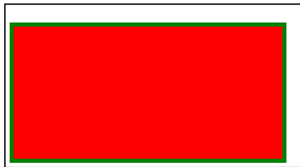
Figure 11-12: red rectangle with green border

>>> from reportlab.graphics.shapes import Rect >>> from reportlab.lib.colors import red, green >>> r = Rect(5, 5, 200, 100) >>> r.fillColor = red >>> r.strokeColor = green >>> r.strokeWidth = 3 >>>