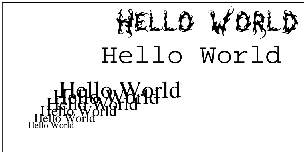
Figure 11-14: fancy font example

d = Drawing(400, 200) for size in range(12, 36, 4): d.add(String(10+size*2, 10+size*2, 'Hello World', fontName='Times-Roman', fontSize=size)) d.add(String(130, 120, 'Hello World', fontName='Courier', fontSize=36)) d.add(String(150, 160, 'Hello World', fontName='DarkGardenMK', fontSize=36))